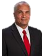
Member since: 2014 Term ends: 2018