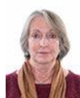
Member since: 2012 Term ends: 2020