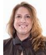
Member since: 2016 Term ends: 2020