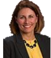
Secretary Member since: 2014 Term ends: 2018