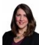
Member since: 2015 Term ends: 2018