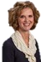
President Member since: 2014 Term ends: 2018