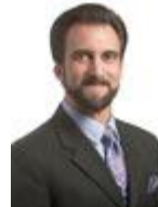
Member since: 2012 Term ends: 2020