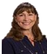
Member since: 2012 Term ends: 2020