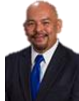
Vice President Member since: 2014 Term ends: 2018